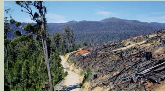
Harvested in 1988 for veneer, sawlog and pulpwood. Logging debris was burnt in March 1989. The area was sown with eucalypt seed collected locally.