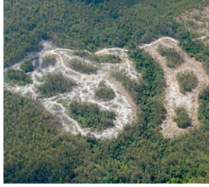
Aerial view of an aggregated retention native forest coupe.

While clearfelling is generally the preferred method of harvesting in wet eucalypt forests, aggregated retention is used in production forests with special significance.