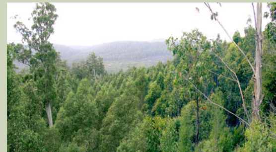
The same forest in 2006.