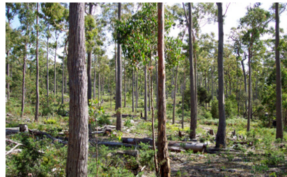
Potential sawlog retention harvest in dry E. delegatensis forest, eastern highlands of Tasmania.