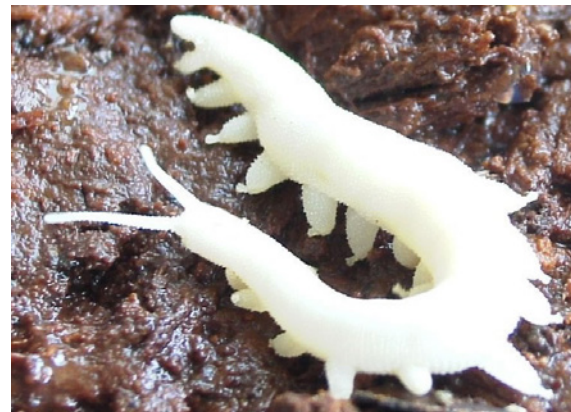
Giant velvet worm (Tasmanipatus baretti). Caterpillar-like, with two antennae, soft velvety skin and 15 pairs of legs. Pink colour and up to 75mm in length when walking. Tasmania's largest velvet worm, endemic to northeast Tasmania, inhabiting decaying eucalypt logs.

Example of a Landscape Context Planning map. This information can help planners decide on the optimal areas of native forest to set aside for long-term retention to maintain biodiversity and threatened species, while allowing Sustainable Timber Tasmania to meet its wood supply obligations.