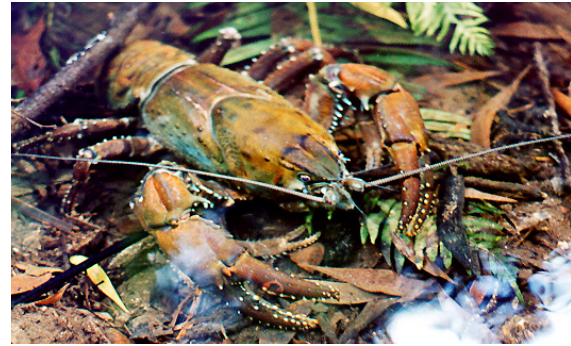
Giant freshwater crayfish (Astacopsis gouldi). Largest freshwater crayfish in the world, and is endemic to rivers in northern Tasmania. Slow-growing and long-lived, growing to around 2 to 3 kg, but has been reported to grow up to 6 kg in size. Naturally occurring in streams and lakes. Indigenous name 'Tayatea'.